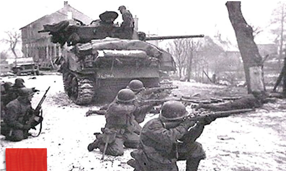
US troops defend Rittershoffen, Alsace, France, January 1945