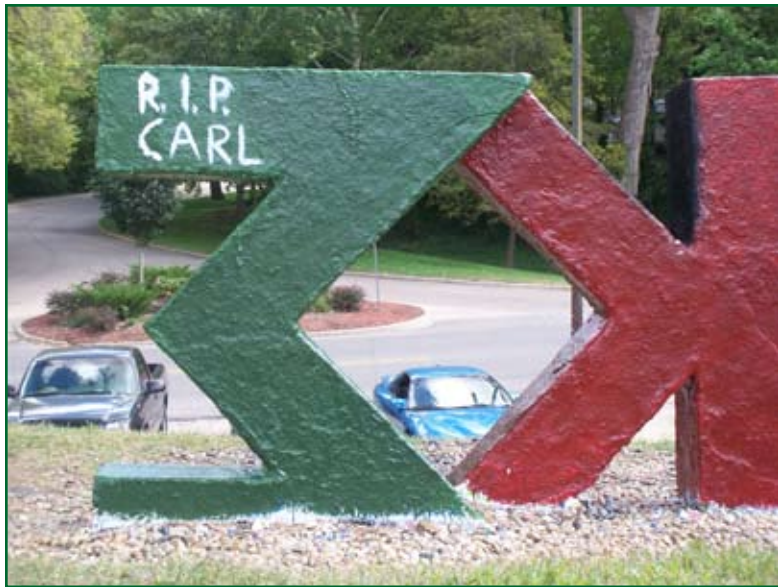
R.I.P Carl the Duck