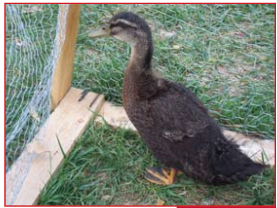
Carl the Duck